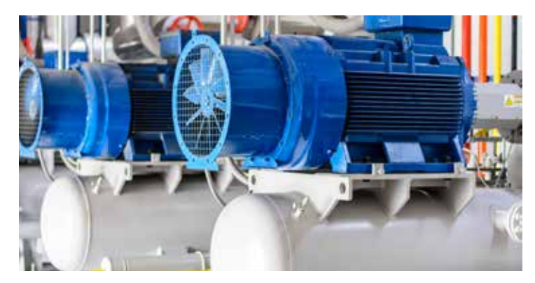
References: [3] "Lubricants for Sustainable Cooling," Peter Gibb, Steven Randles, Michael Millington, and Andrew Whittaker, Uniquema Lubricants.

With the extensive use of refrigeration and air conditioning systems, the industry is coming under pressure to improve energy efficiency. It is estimated that, in the U.S., 15% of the total energy consumption in a modern building is due to the refrigeration and air conditioning system.<sup>[3]</sup> The lubricant in a refrigerant system, as with many other types of equipment, can play a key role in reducing friction and energy consumption.